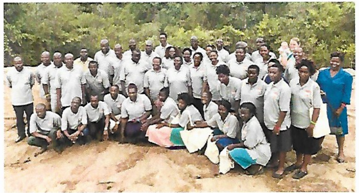
Living Proof Chaplains and Patrons in their new shirts

We are needing to update our email address list. If your email address has changed, please email us at hvcm@hippovalley.org to let us know about the change. We prefer to send any correspondence via email to help curb administrative costs and your help with this is appreciated.