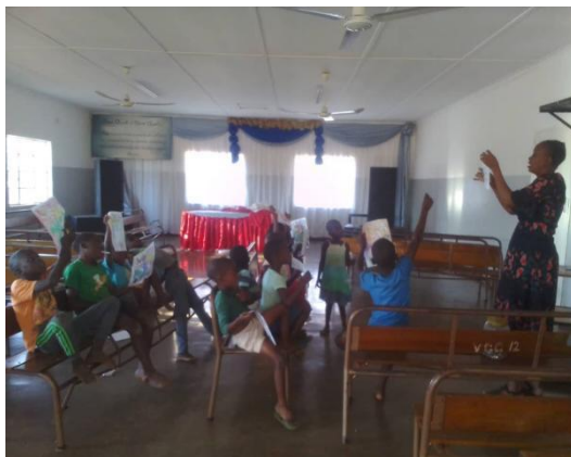
AWANA booktime with Chaplain

We are also glad that Chaplain is back and she will continue with the AWANA lessons with the children.