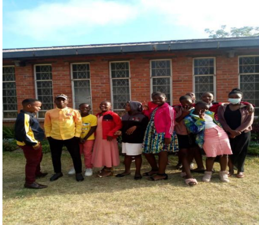
Our youths at the National Youth Conference at CACC

We are also glad that Chaplain is back and she will continue with the AWANA lessons with the children.