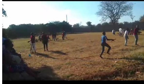
AWANA Gametime with Chaplain

winning, are all improved during AWANA game time.