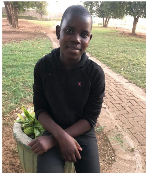
our new girl